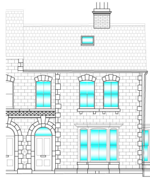
AS EXISTING WEST ELEVATION (Scale 1:50)