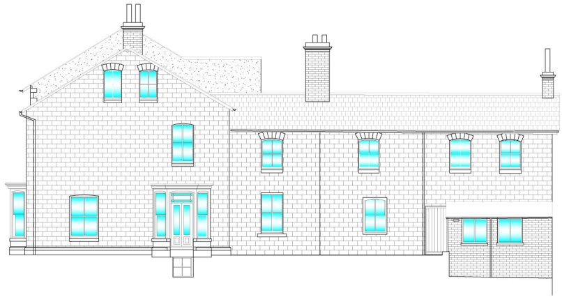
AS EXISTING SOUTH ELEVATION (Scale 1:50)